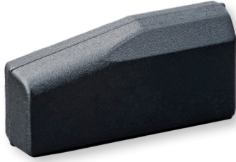
Texas 80 Bit Plus Transponder

The first worldwide transponder cloning solution for most Ford®, Hyundai® and Kia® models that are using TI 80 bit transponders. You can now provide cloning and/or pre-coding for Ford®, Hyundai®, Kia®, Toyota®, and Subaru® keys.