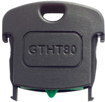
GTHT80 Plus Modular Head